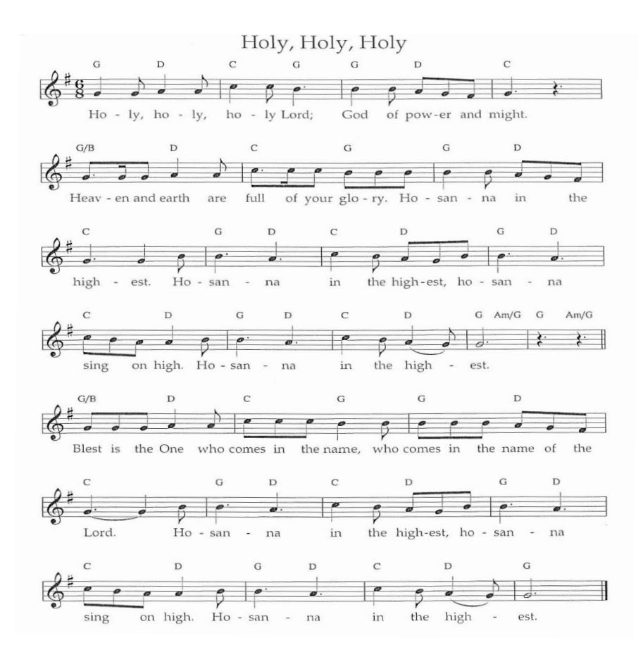
..... as we proclaim the mystery of faith: